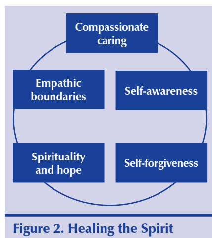
Figure 2. Healing the Spirit